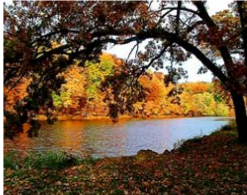
Pinicon Ridge Park, Central City, Iowa